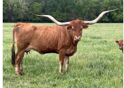
MTR DANCER 12/20