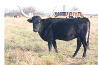
MI TIERRA G105